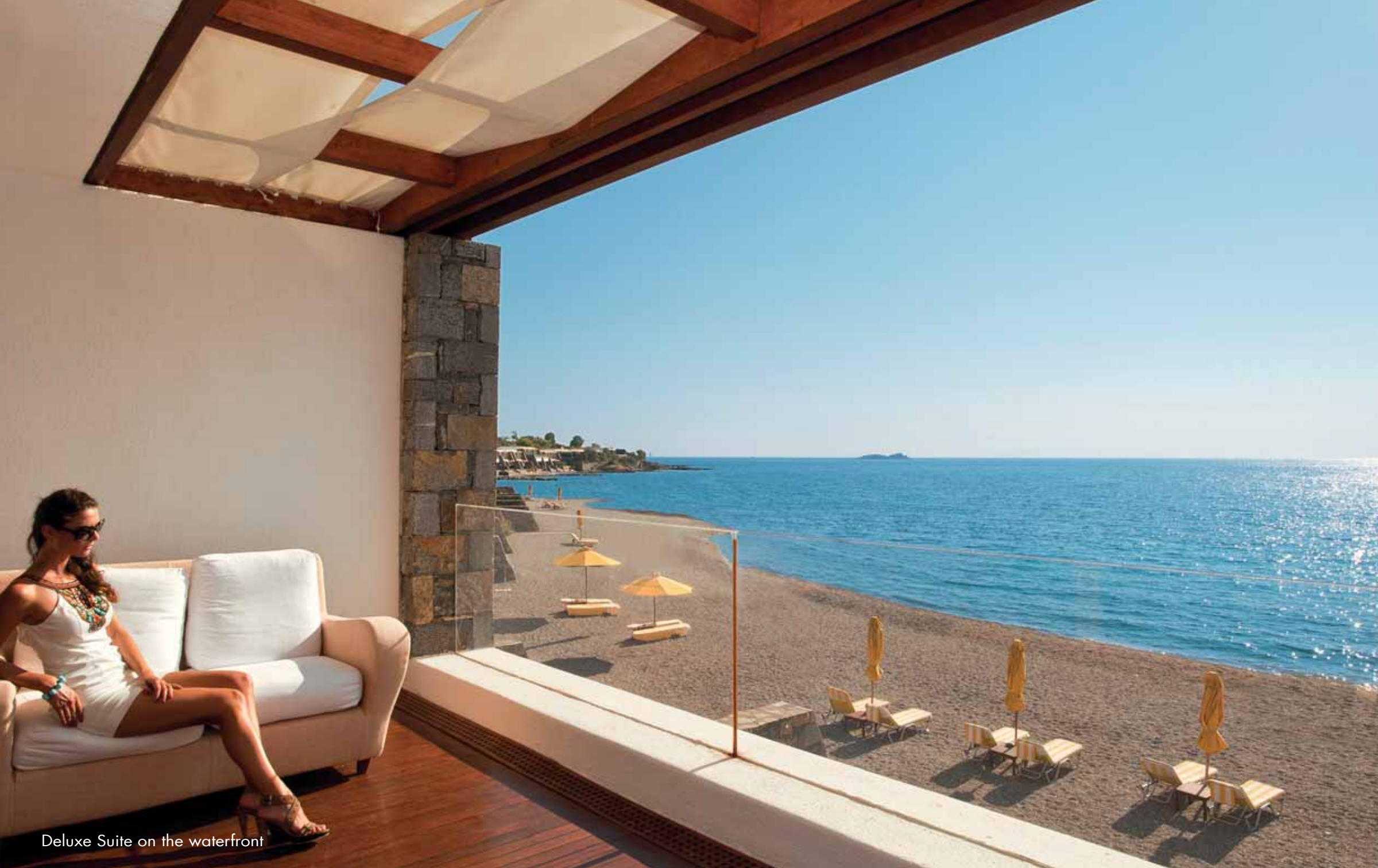
Deluxe Suite on the waterfront