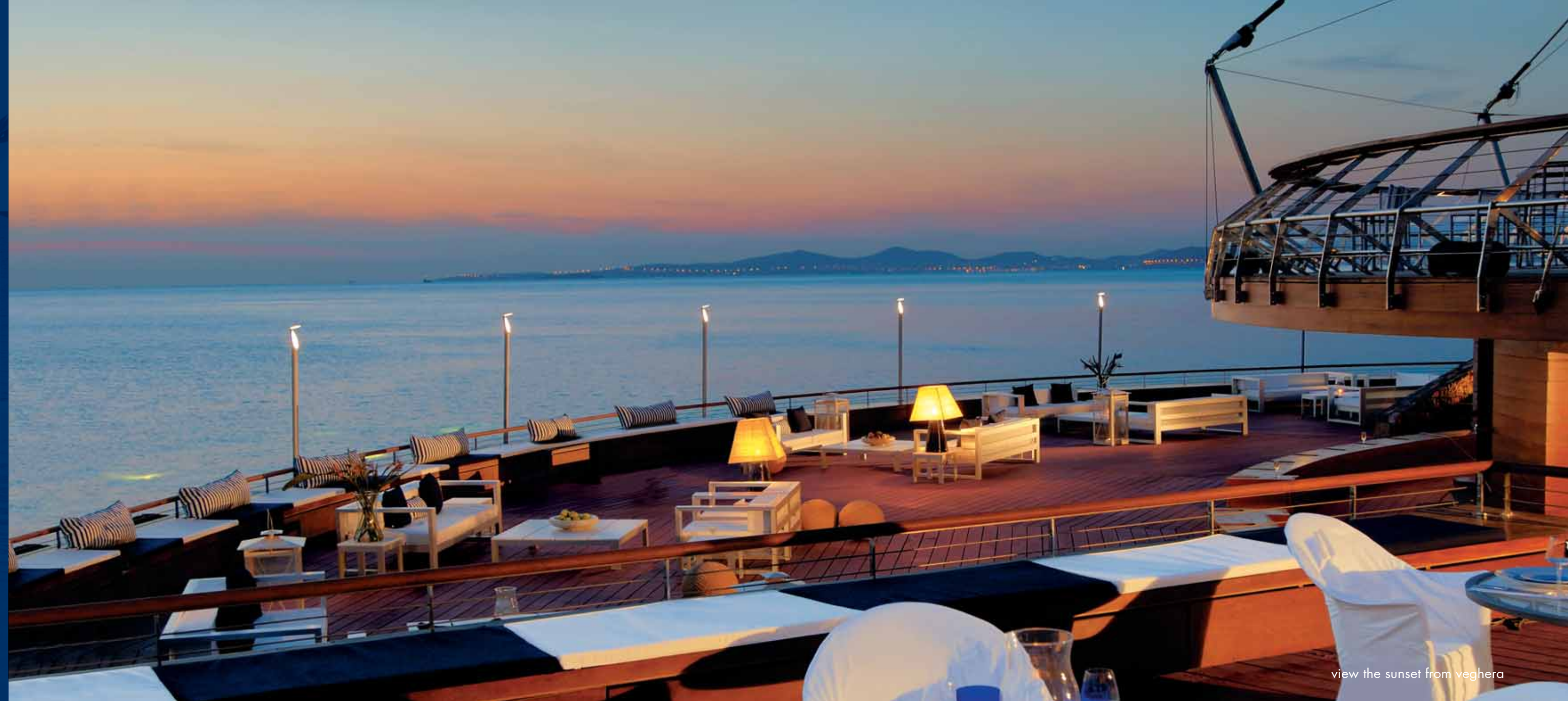
view the sunset from veghera

Moved by the sway of romance, your steps will lead you to the international restaurant and bar, discreetly isolated at the southern edge of the peninsula. Chic and modernly designed with unlimited sea view, it is the ideal setting to enjoy delicious culinary options.