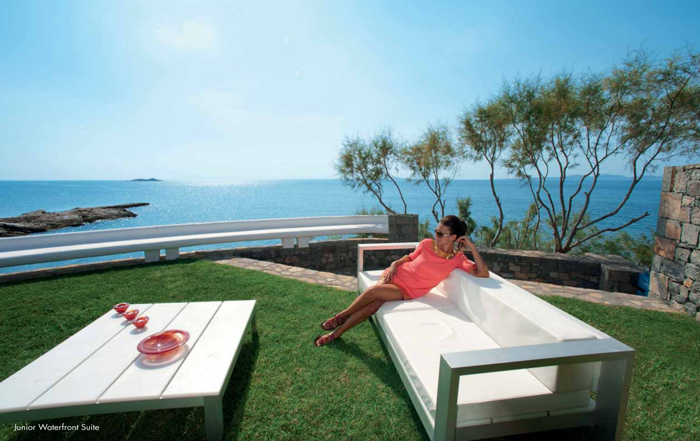
Junior Waterfront Suite