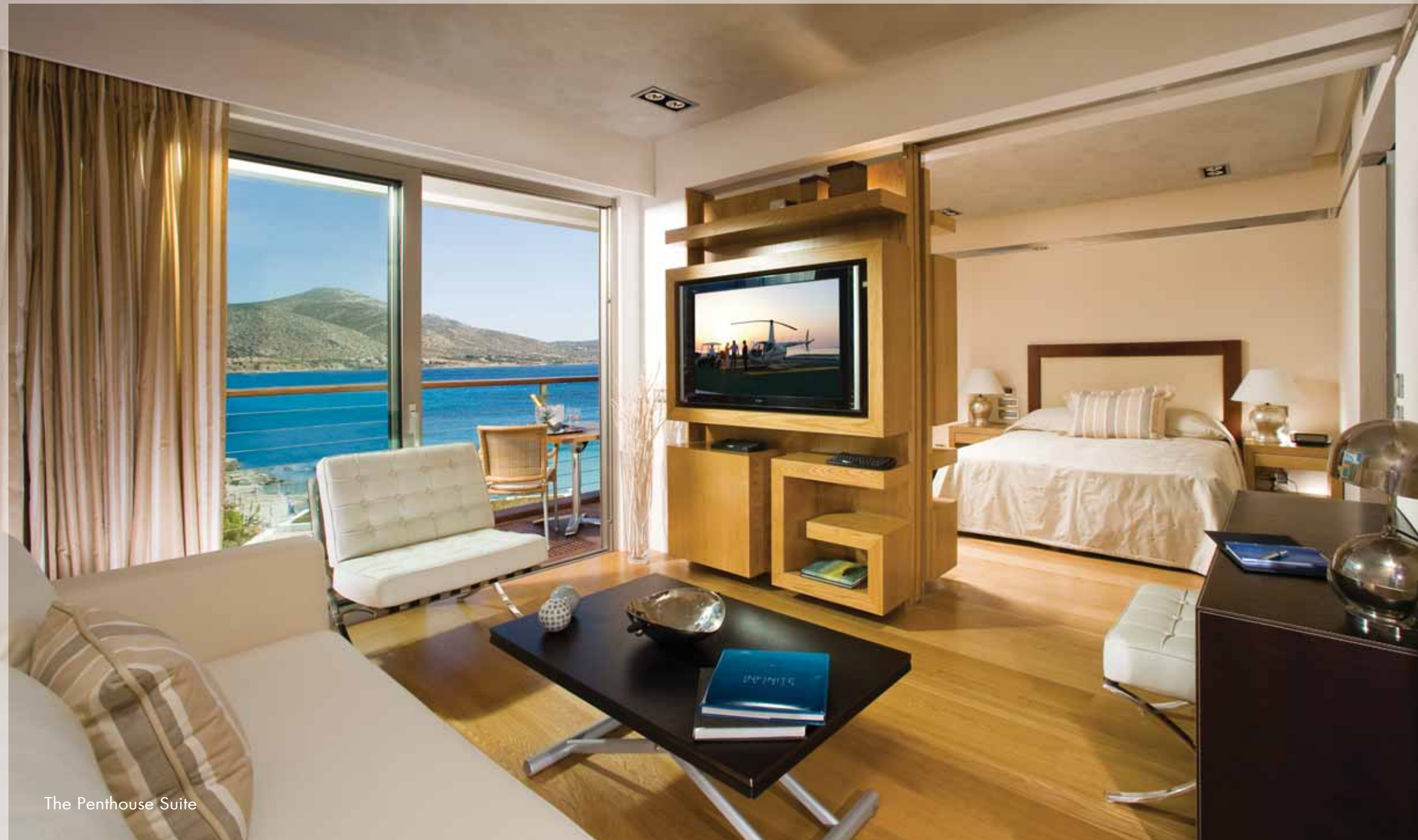
The Penthouse Suite