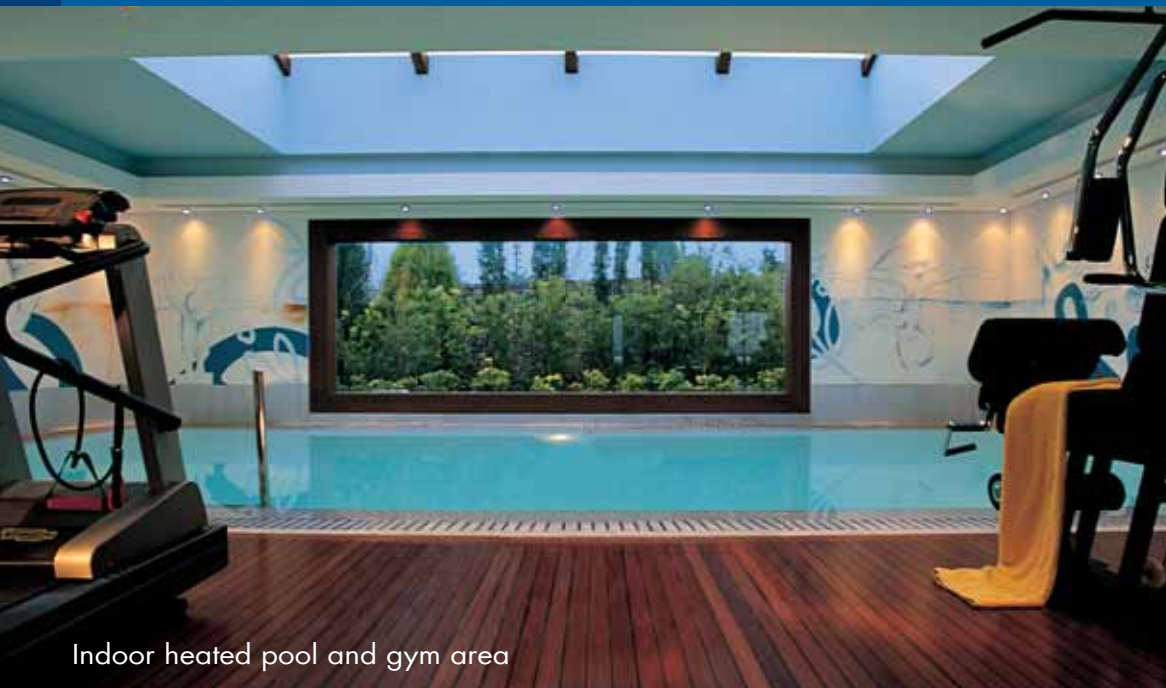
Indoor heated pool and gym area

The crown jewel of the resort -The Royal Villa- offers the ultimate in lavish exclusivity, occupying its own private cove by the water's edge.