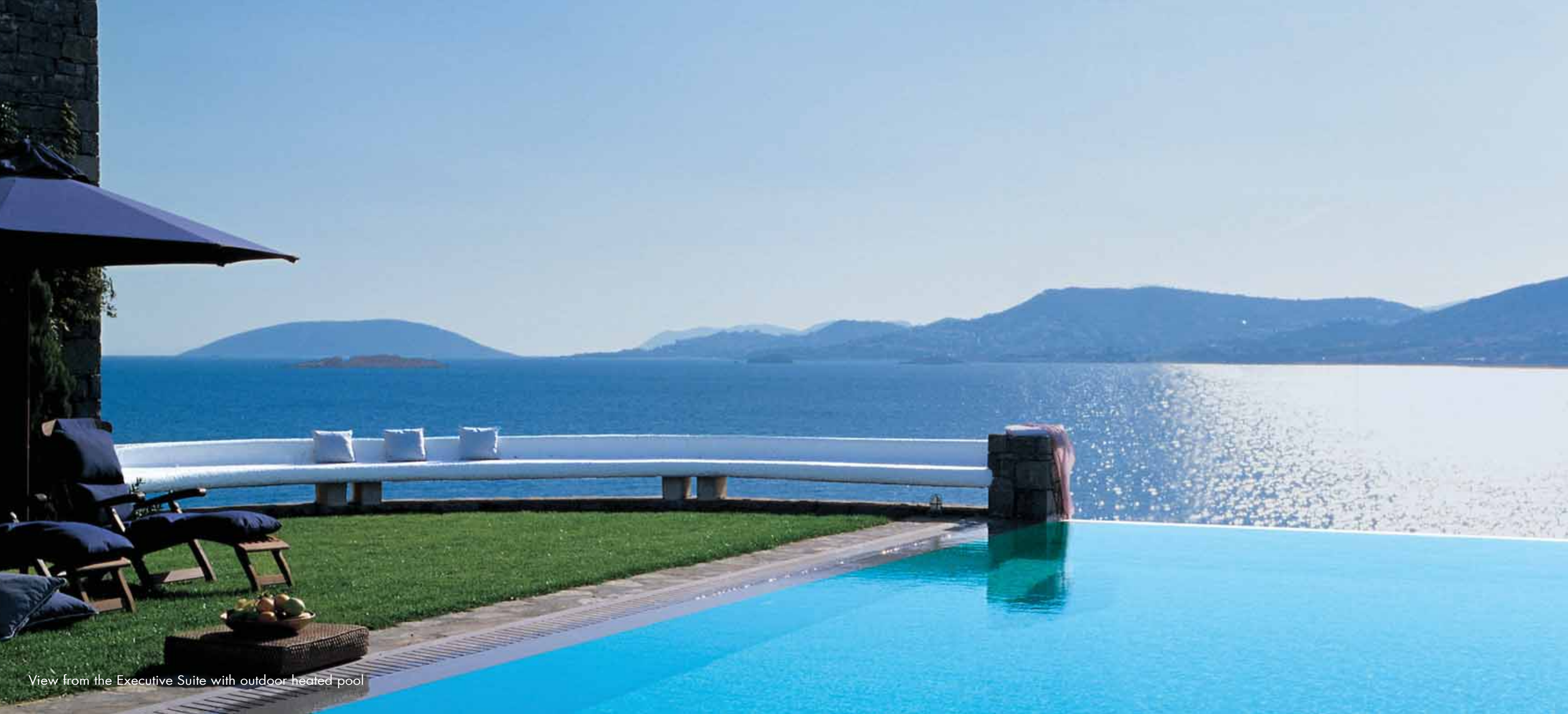
View from the Executive Suite with outdoor heated pool