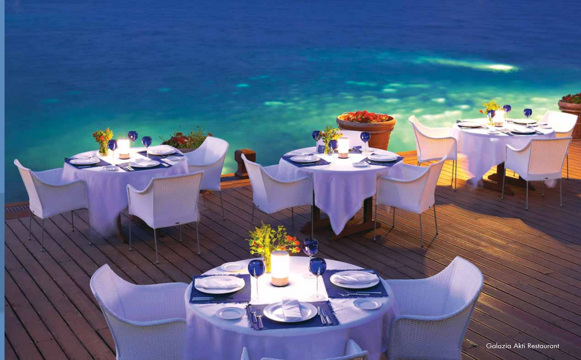
Galazia Akti Restaurant

Classified as one of the best traditional restaurants in the south side of Athens, the old-time favourite Ouzeri, serves fresh fish and seafood, home made traditional specialities and delicious desserts in a truly Greek setting by the sea.