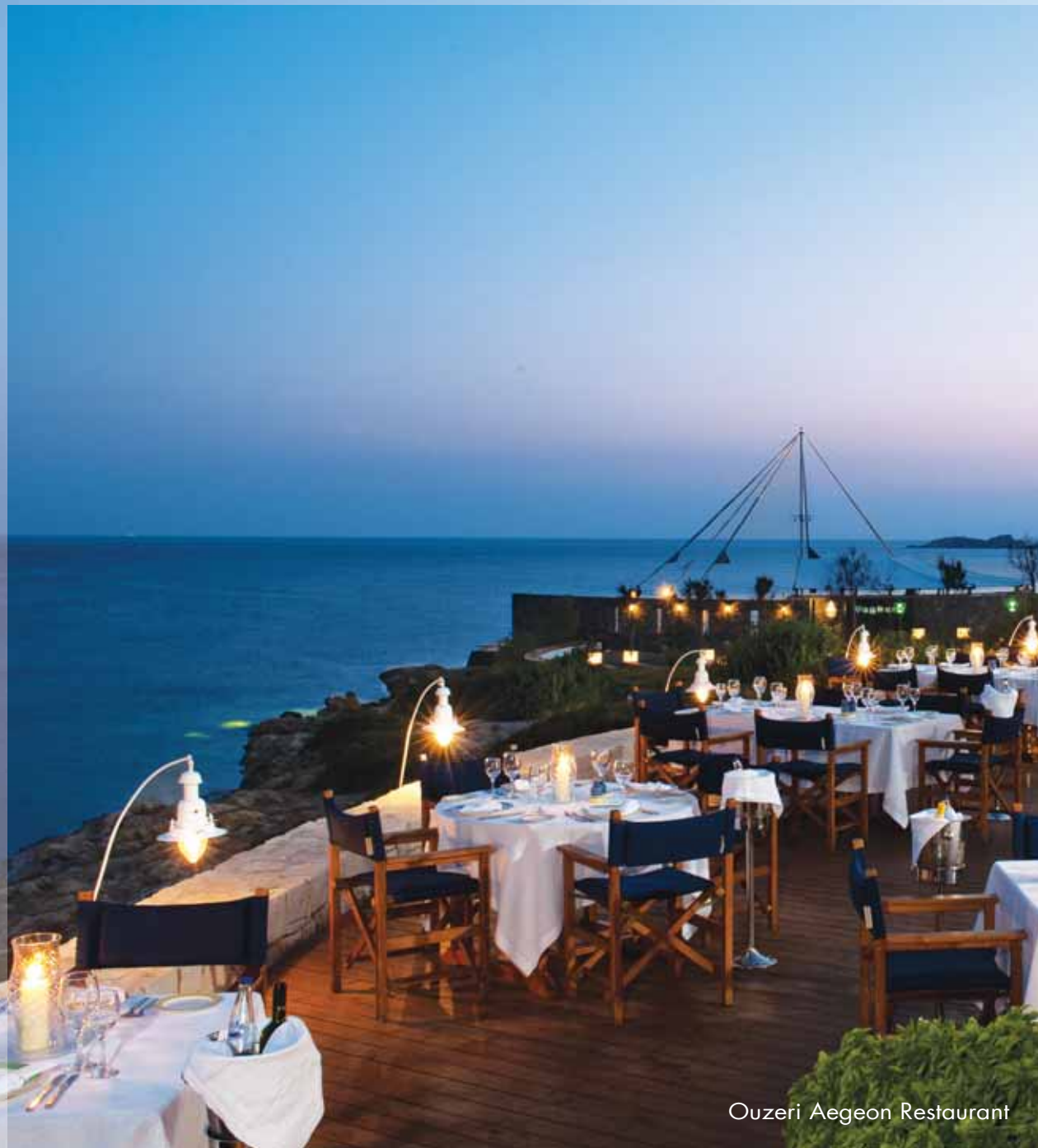
Ouzeri Aegeon Restaurant