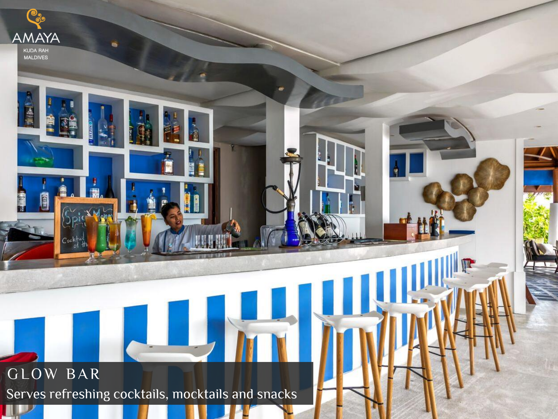
GLOW BAR Serves refreshing cocktails, mocktails and snacks