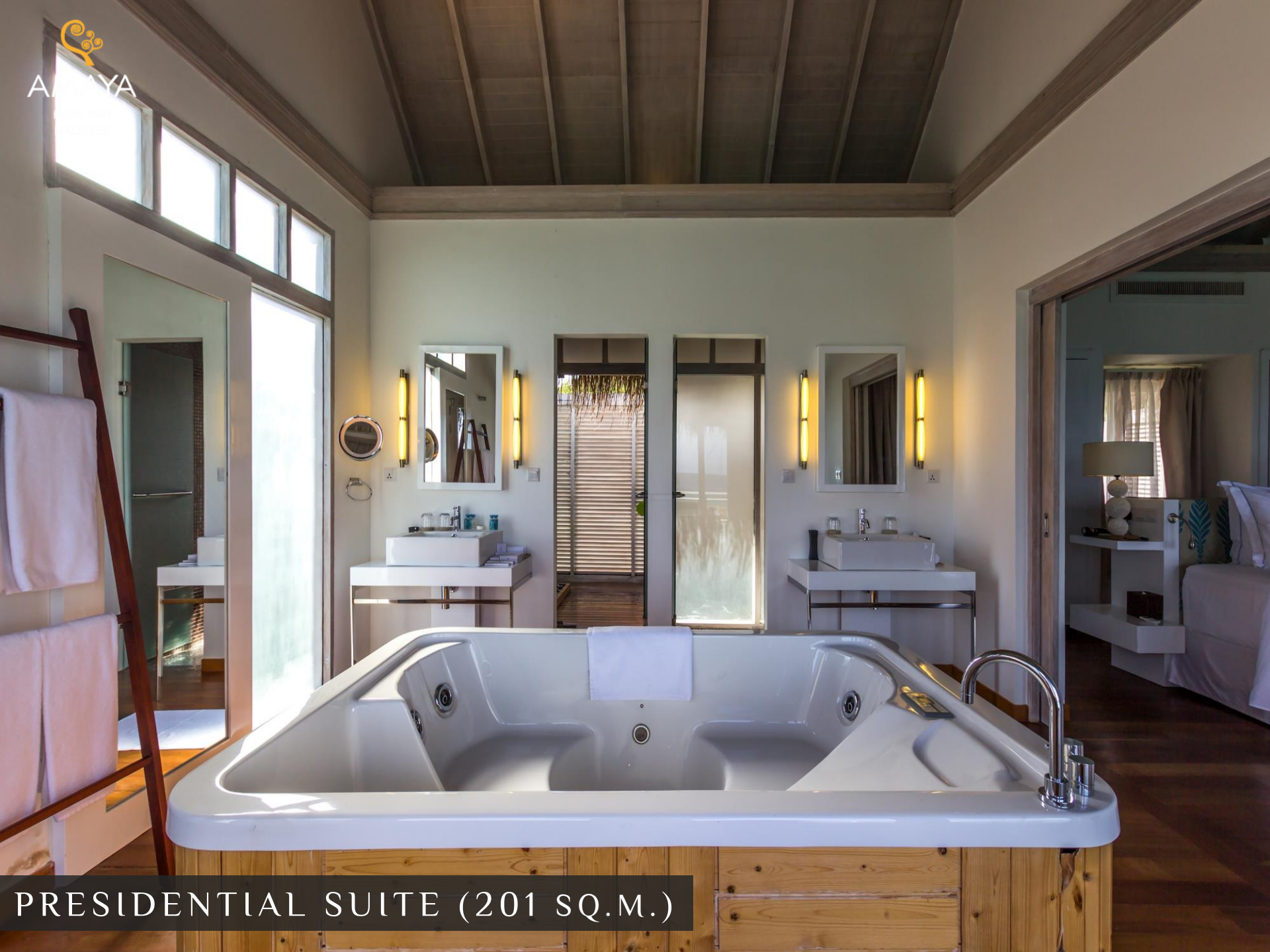
PRESIDENTIAL SUITE (201 SQ.M.)