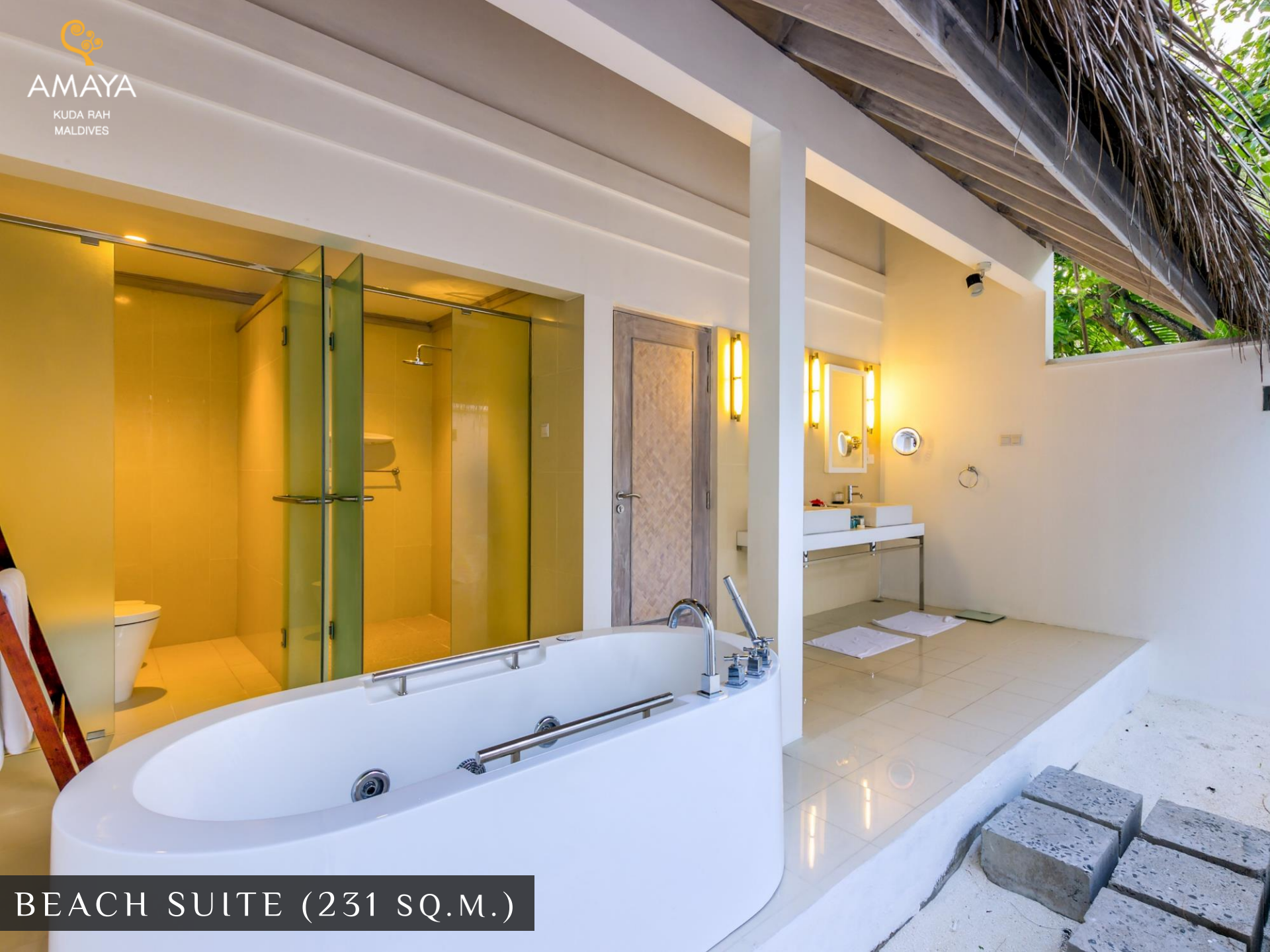
BEACH SUITE (231 SQ.M.)