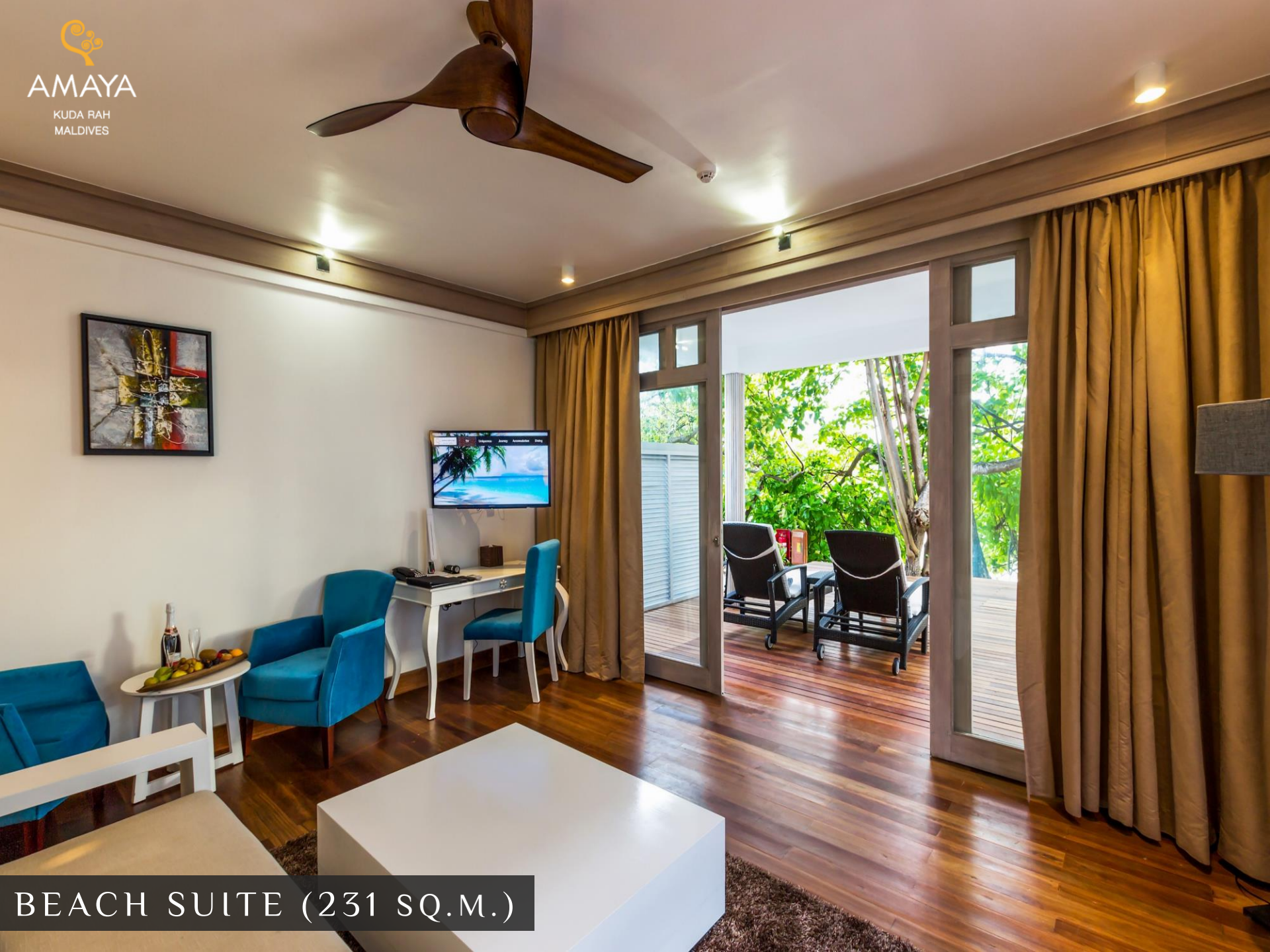
BEACH SUITE (231 SQ.M.)