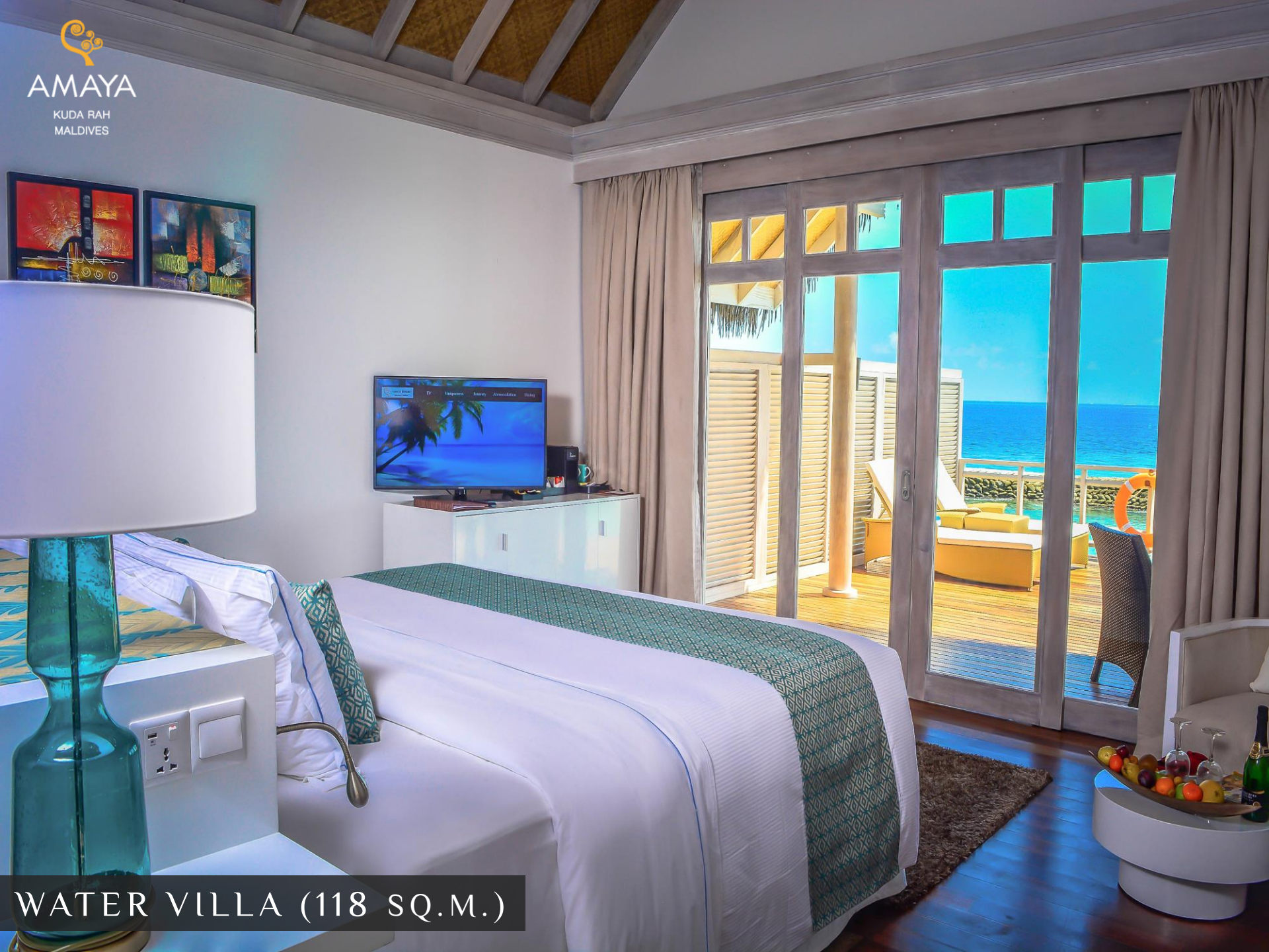
WATER VILLA (118 SQ.M.)