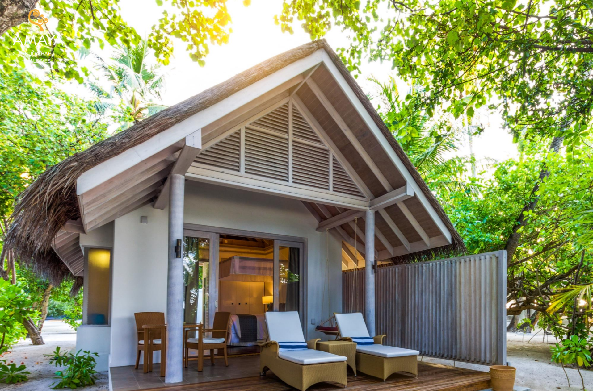
14 BEACH VILLAS (90 SQ.M.) Detached villas surrounded by lush gardens, with a private plunge pool and sundeck