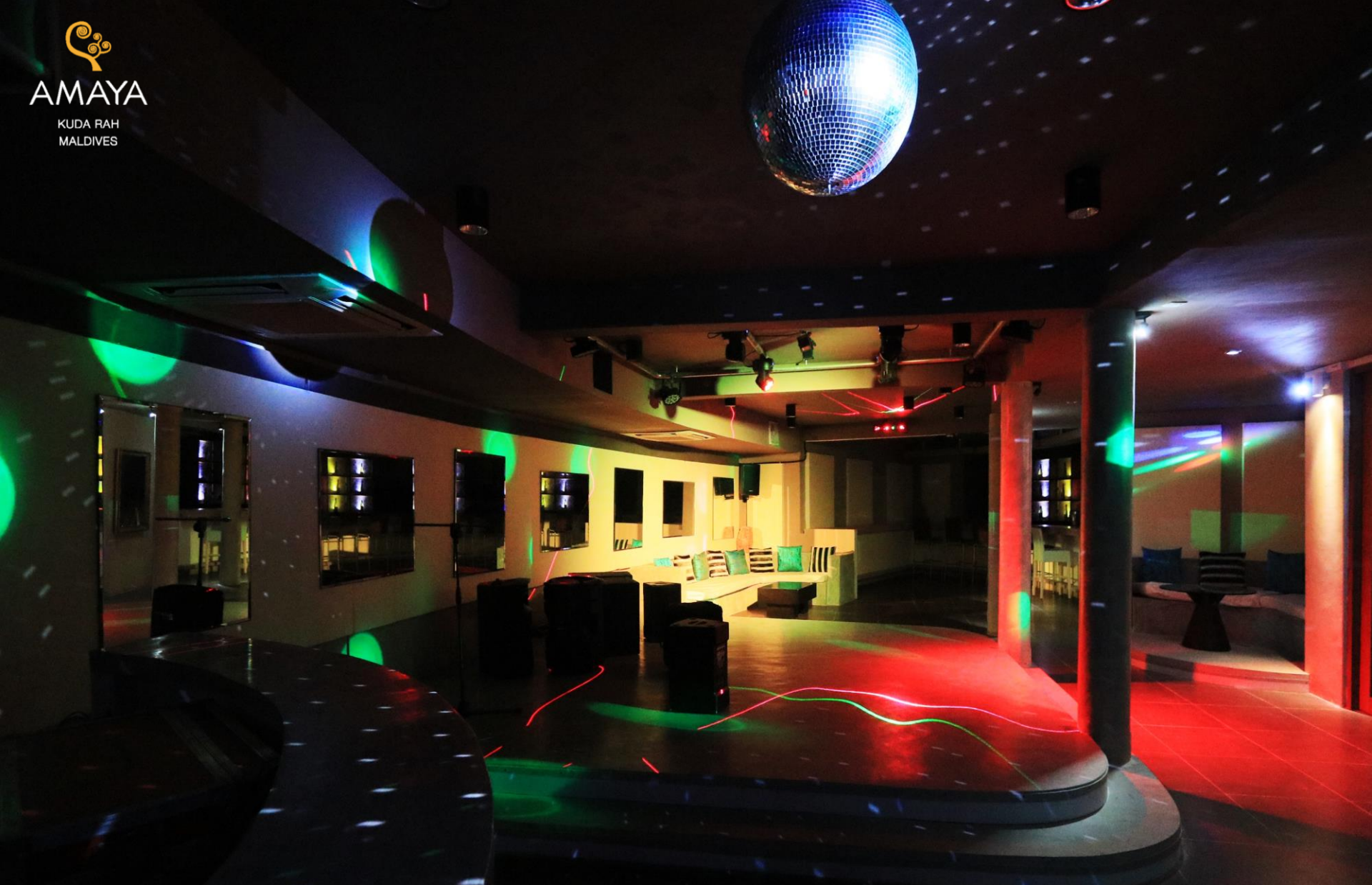
BLUEZ BAR First underground discotheque in the Maldives