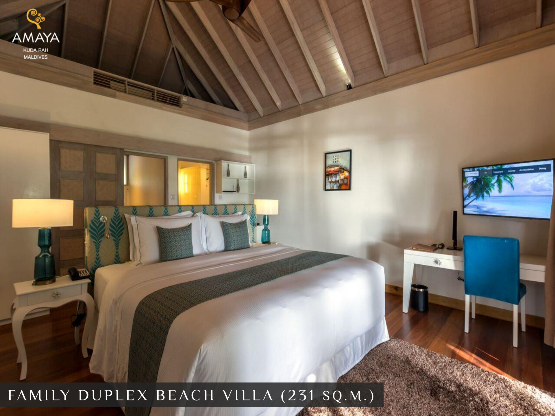
FAMILY DUPLEX BEACH VILLA (231 SQ.M.)