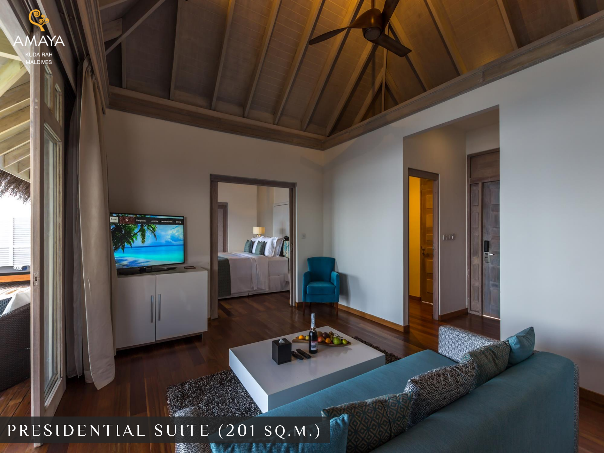
PRESIDENTIAL SUITE (201 SQ.M.)