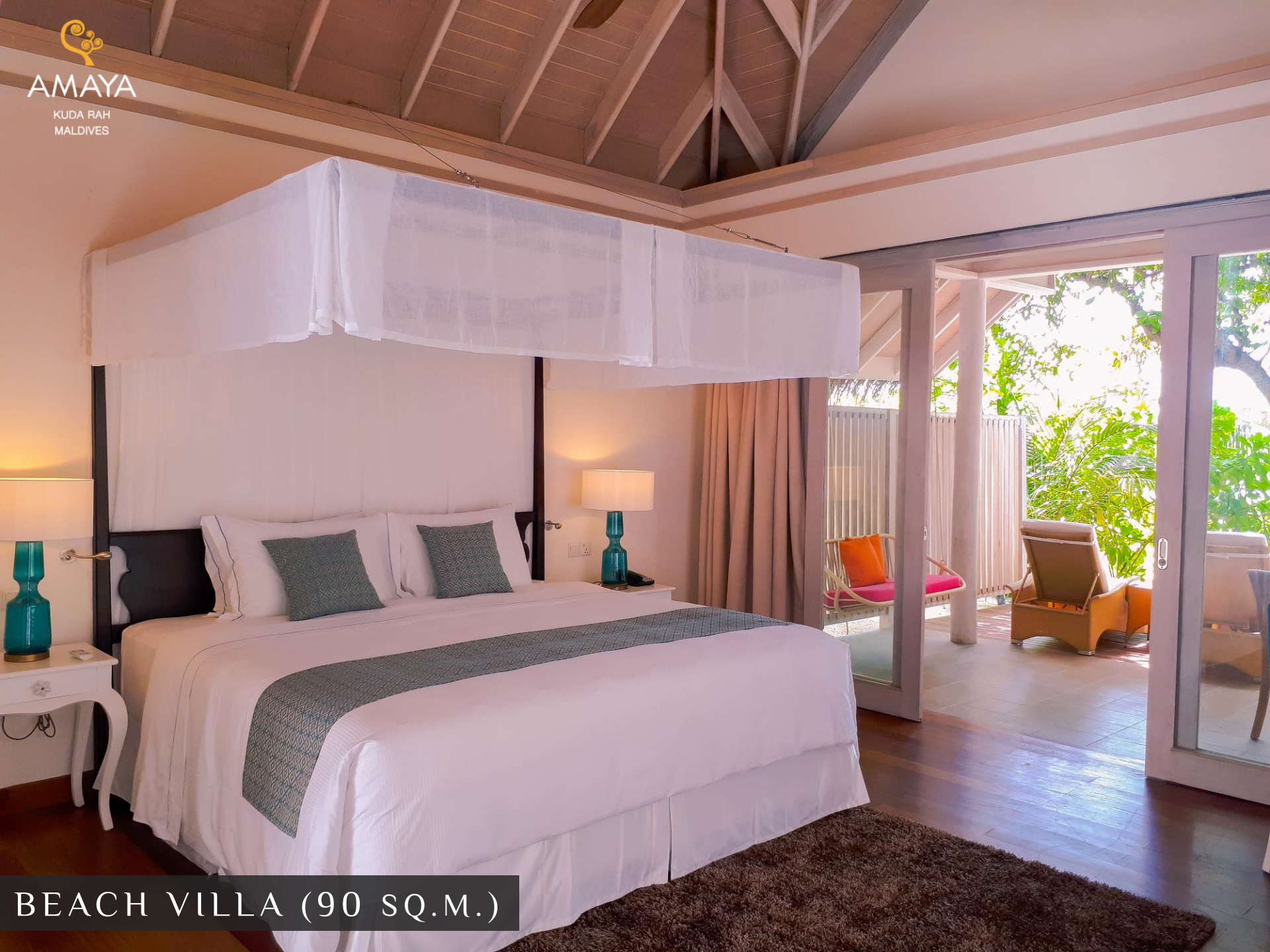
BEACH VILLA (90 SQ.M.)