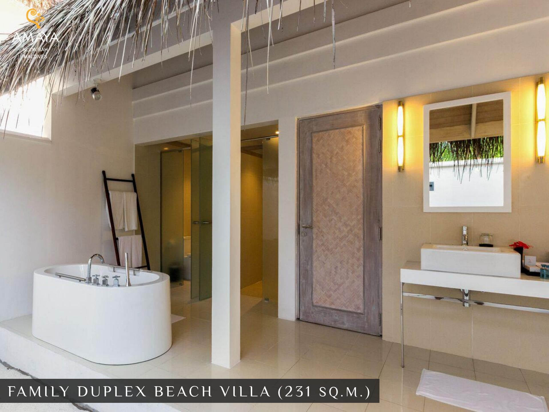
FAMILY DUPLEX BEACH VILLA (231 SQ.M.)