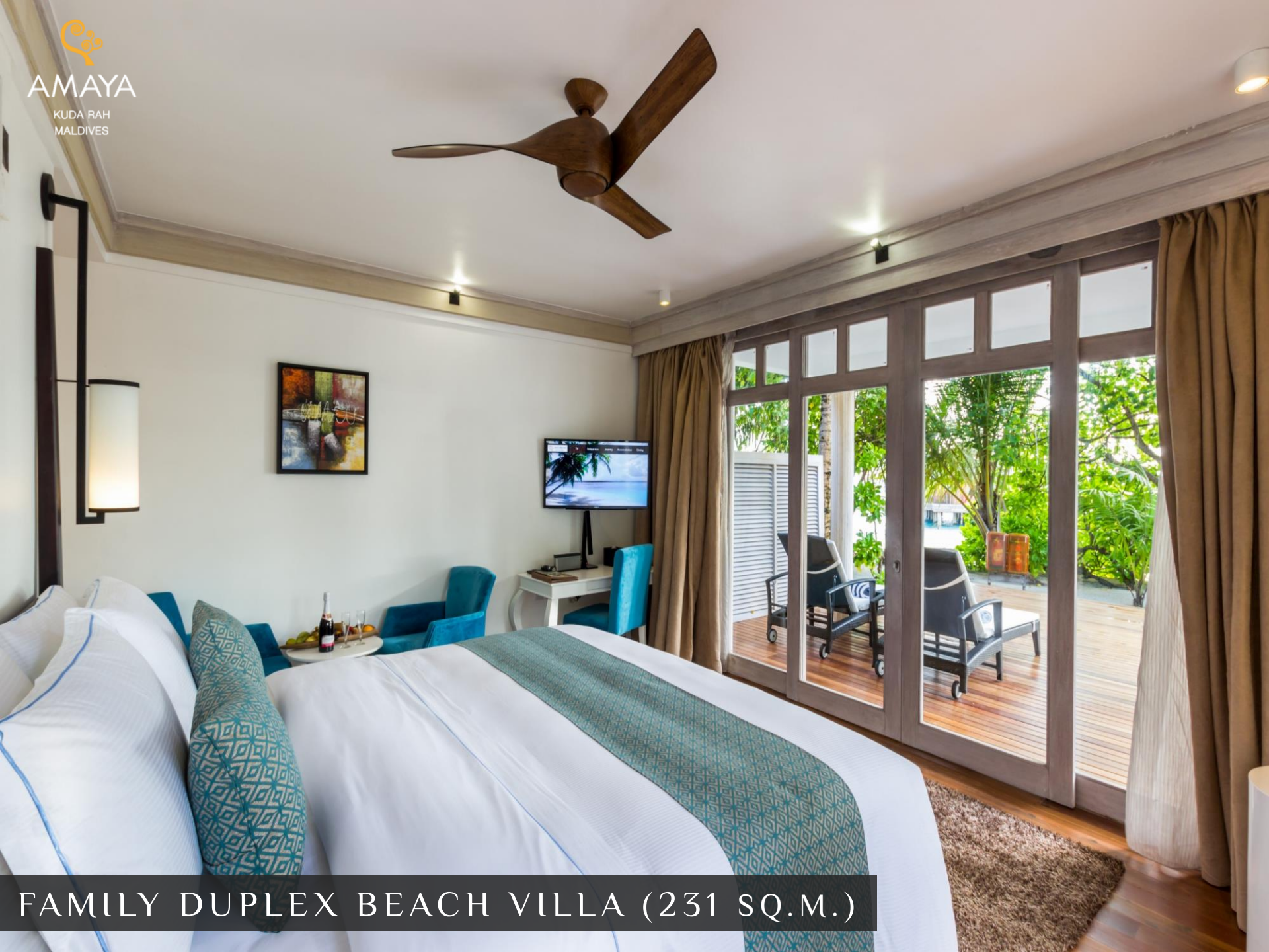
FAMILY DUPLEX BEACH VILLA (231 SQ.M.)