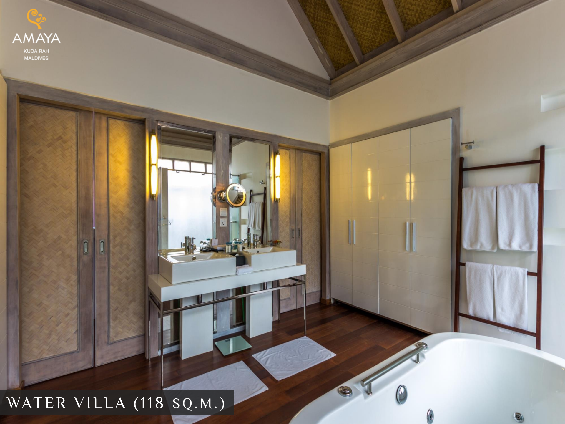
WATER VILLA (118 SQ.M.)