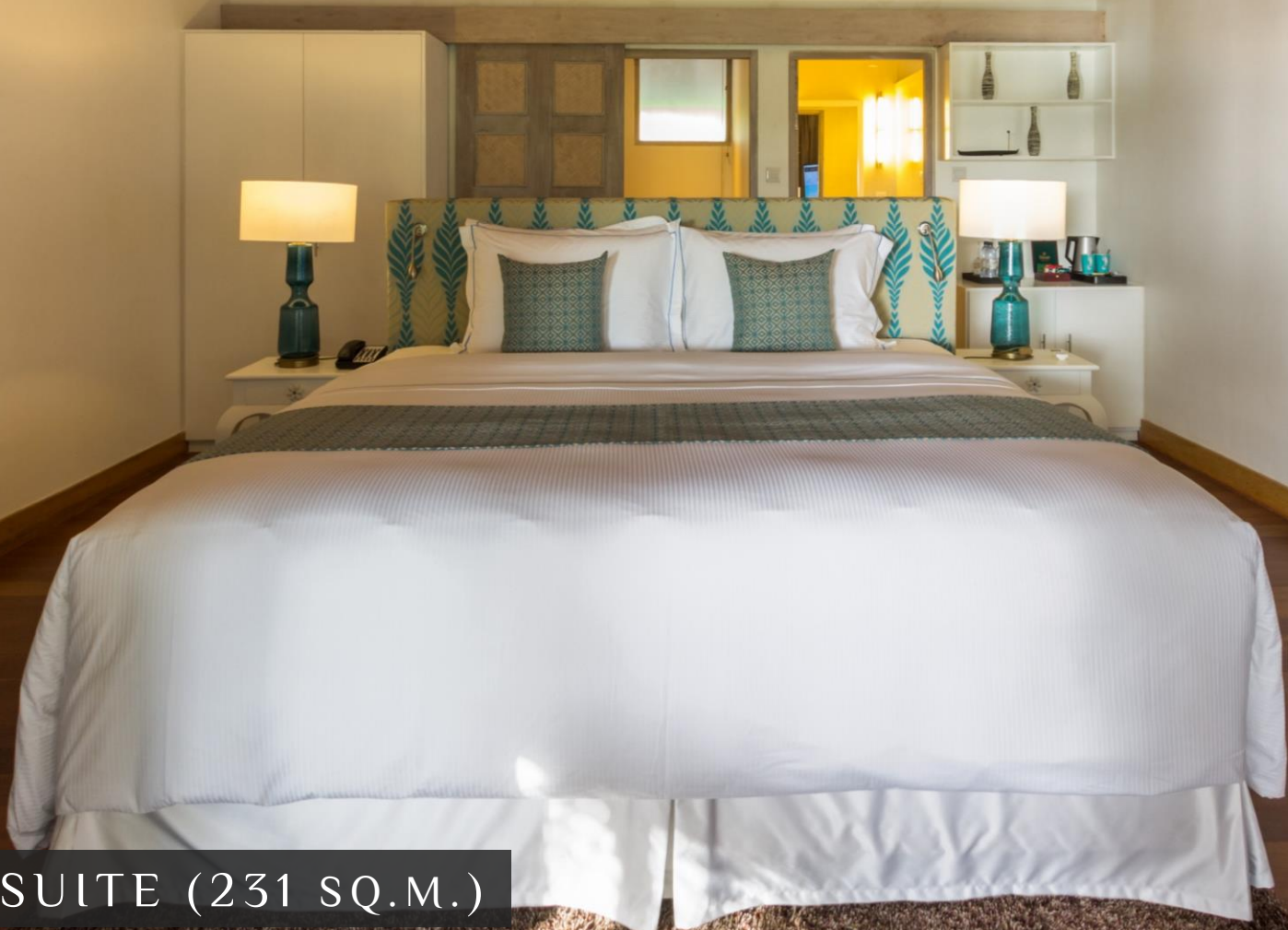
BEACH SUITE (231 SQ.M.)