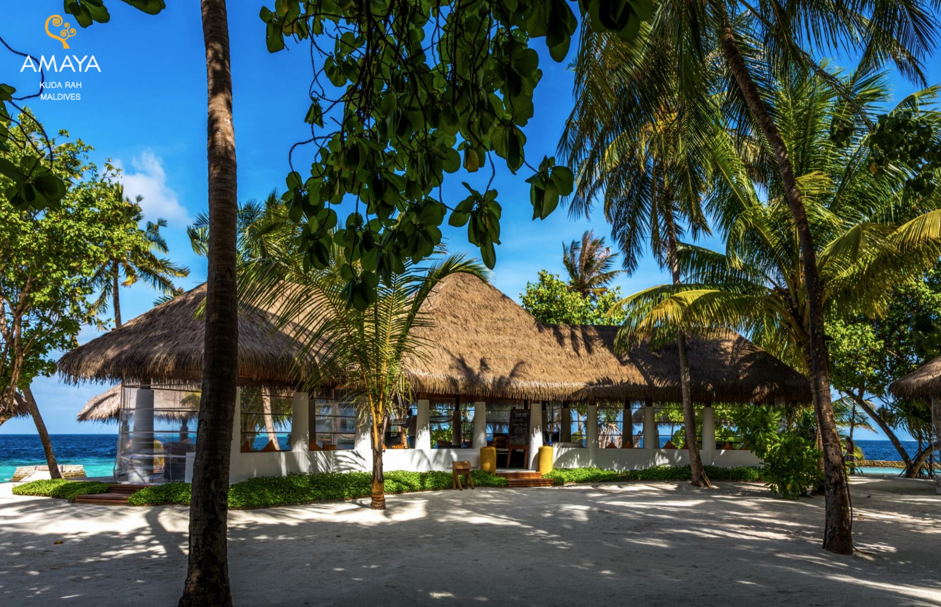
HALF LIME RESTAURANT Serves a la carte – Thai, Indian and Middle Eastern cuisines